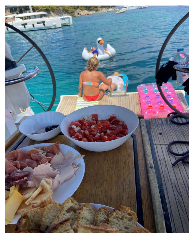
Please note that itineraries are subject to change due weather conditions or other circumstances beyond our control

Monohull: $2,095 per person, double occupancy Catamaran: $2,250 per person, double occupancy